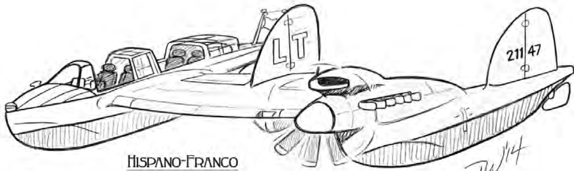
HISPANO-FRANCO AEROMARINE RUNABOUT 'VENICE'

Everyone who ever flew one loved the eccentric flying qualities of the Hispano-Franco company's Aeromarine Runabout. It turned on a dime - usually the moment you relaxed your death grip on the joy stick. It had a faster rate of dive than any other aircraft in the sky - giving the pilot little chance of recovering from a momentary loss of attention before hitting the waves. Most of all, beware takeoff in choppy seas. The spinning propeller had little enough clearance even in calm water. The plane's only real virtue was that it was easy to tie up to the dock, thanks to the handy cleat attached to the fore deck, which hardly ever separated from the wood once the original four screws were increased to six. The example illustrated, christened "Venice," was owned briefly by actor William (Hopalong Cassidy) Boyd, who won it at poker. Thinking he had won a ranch, he ordered it sunk at first sight. It was raised 60 years later and restored for Michael Jackson.