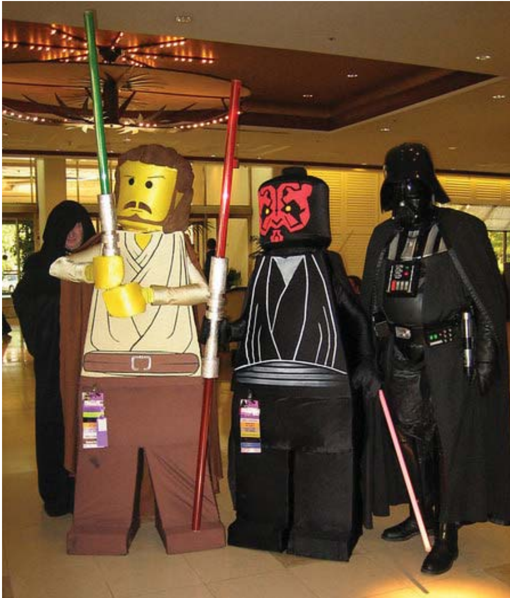
Star Wars Lego, Best in Show for workmanship