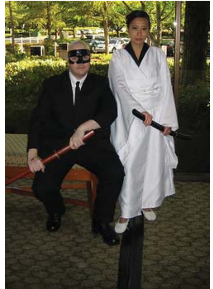
Kill Bill, Hall Costume award winners

costume, singing and dancing, so masquerades are a natural fit for me. I was a little nervous when we went on stage but after that it just finished so quickly! Our group was called the "Spam-ish Inquisition" and we performed the song "Knights of the Round Table." The first half was from the movie Monty Python and the Holy Grail (where we acted serious) and the second half was from the musical Spamalot (where we really hammed it up).