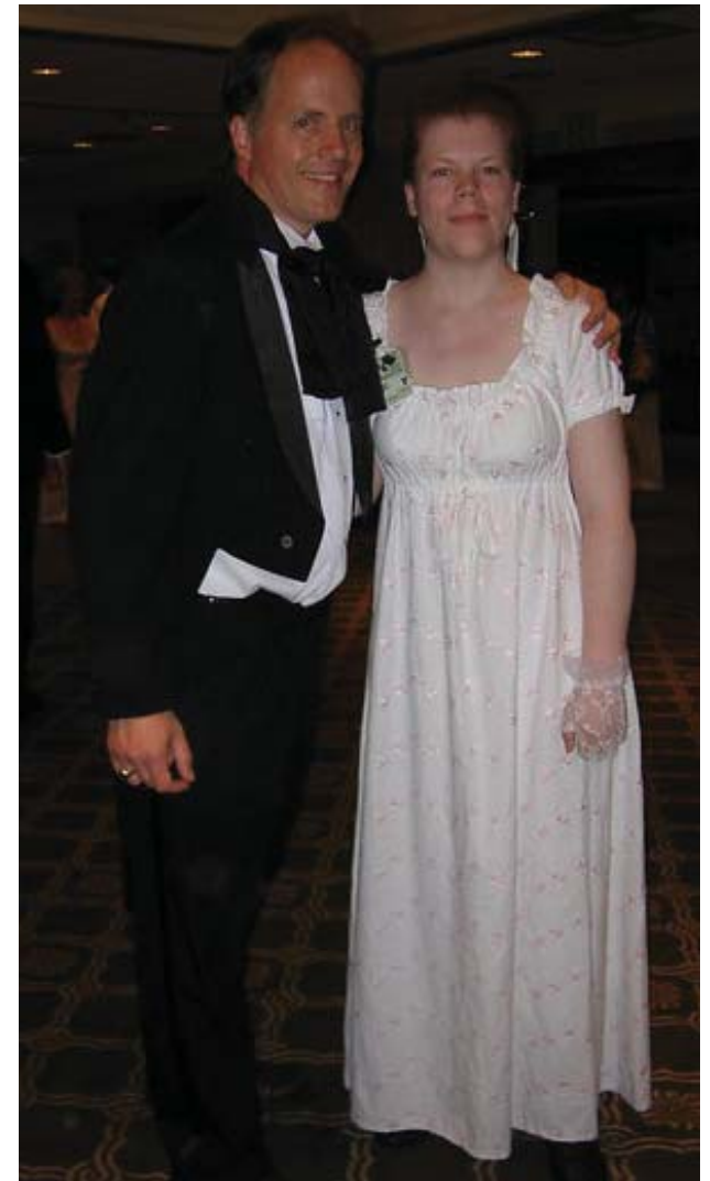
Regency Lord and Lady