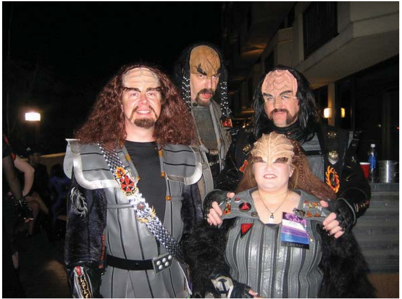
Klingons at Mara's Bar

check in and pick up my BayCon badge before I had to go to the Legion of Rassilon meeting that same evening. This was really convenient because it was literally right across the freeway. I didn't want to miss the meeting as they were showing two episodes from the second season of Doctor Who .