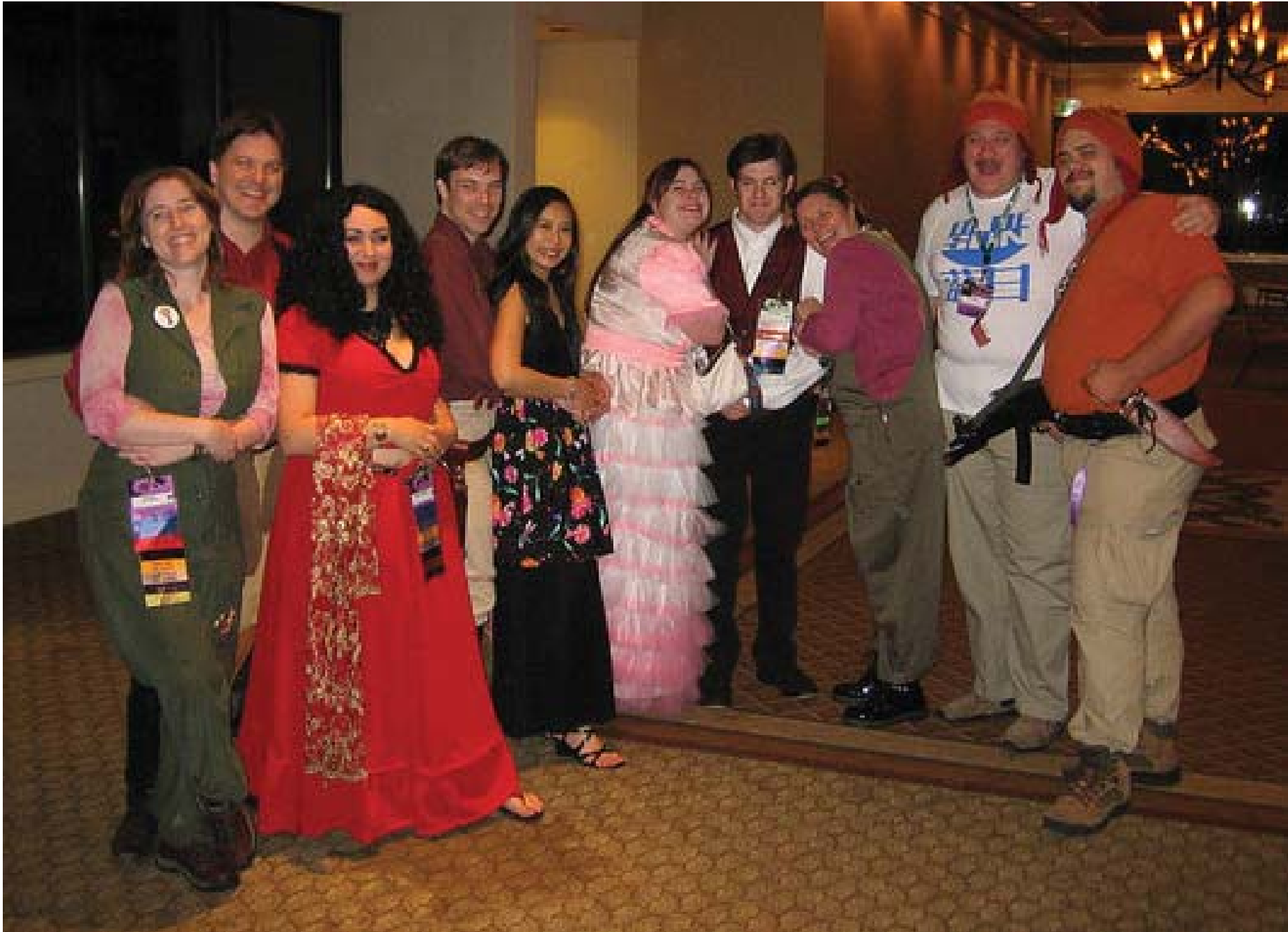
Multiple Characters from the crew of Serenity