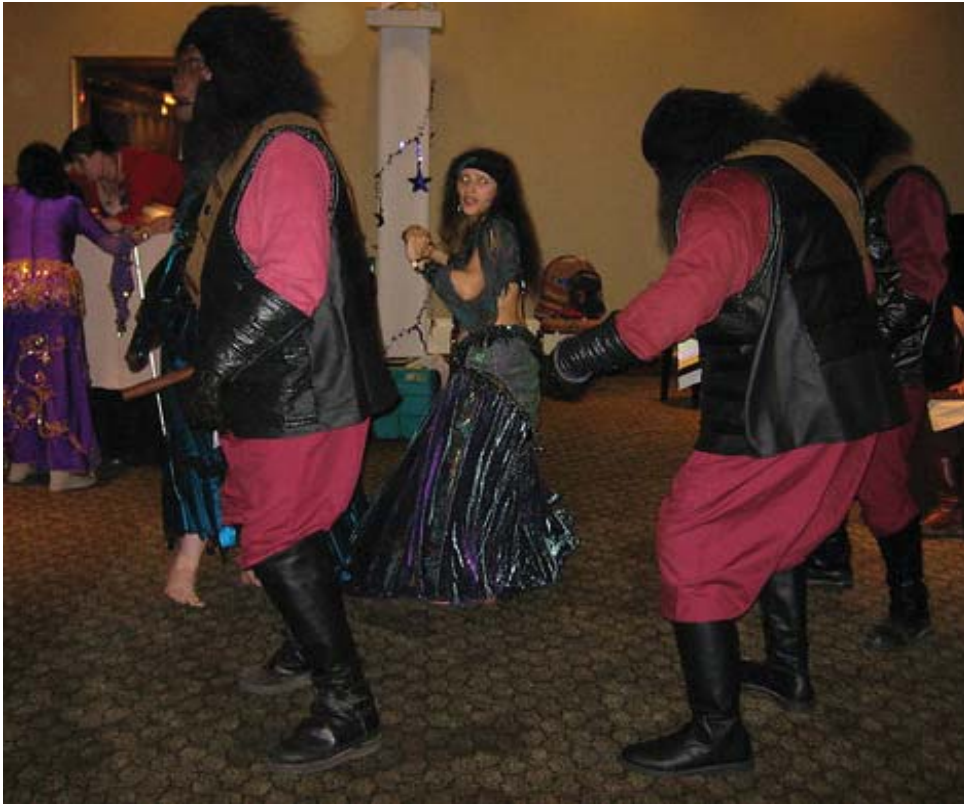
Planet of the Apes belly dancing