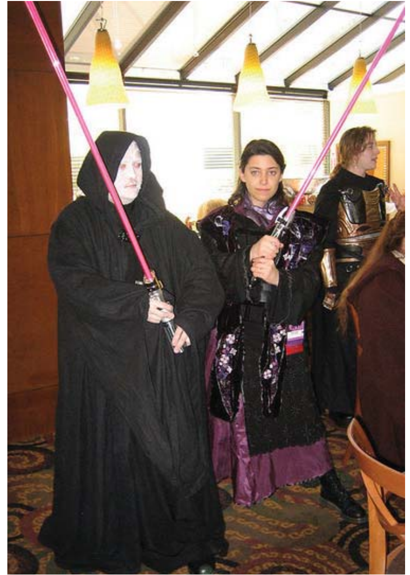
Star Wars group eating Sushi