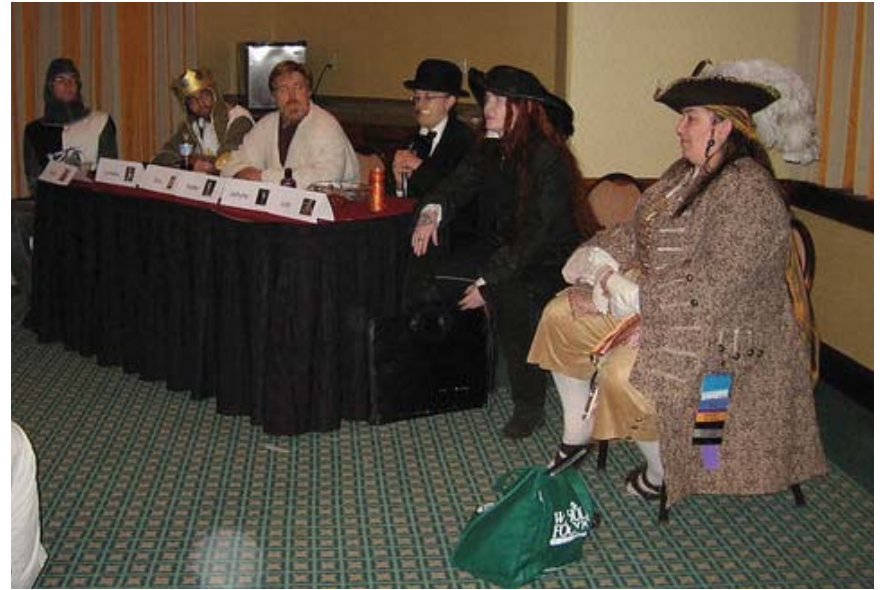
Women in Beards panel

So now I have George Lucas's autograph on an already important piece of memorabilia. I got a glimpse of George and