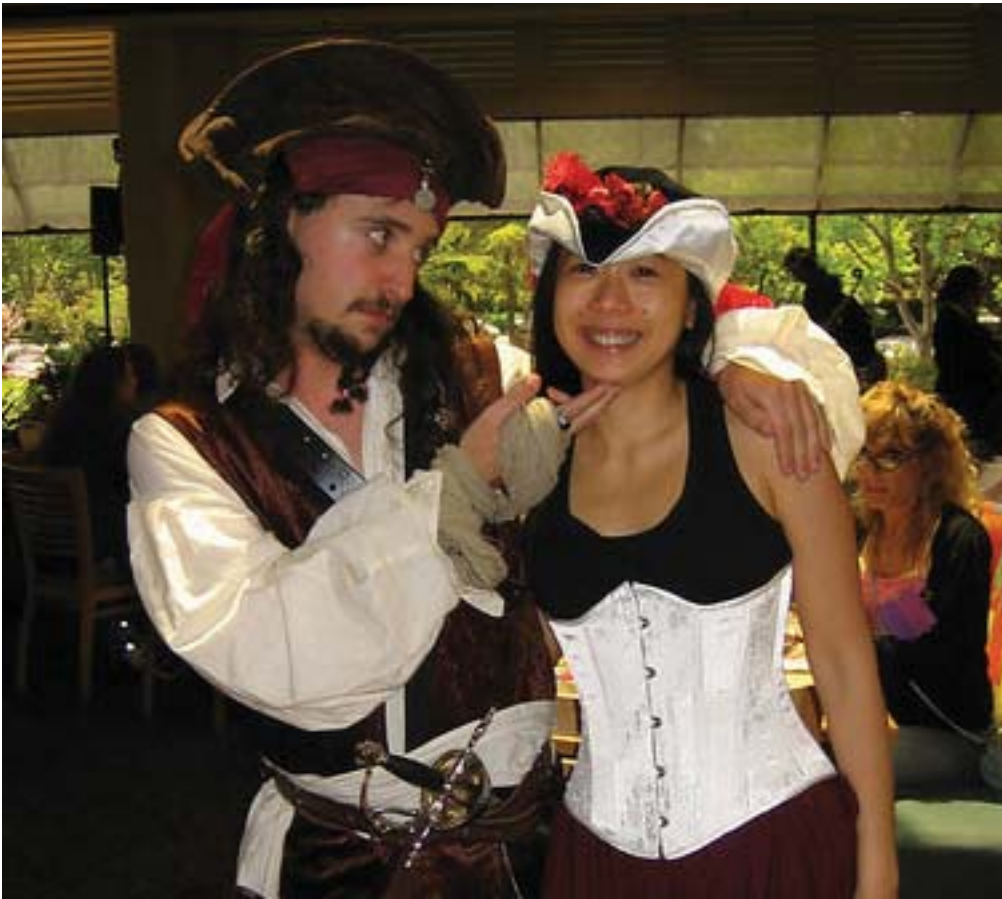
Captain Jack Sparrow and Pirate Lady

the other entries. The caliber of the performers was pretty high! Lots of clever, creative and original entries. But everyone was so friendly and there was a sense of camaraderie as opposed to competition. There were several people I knew as well. Also, I was just there really to have fun and perform. I love dressing up in