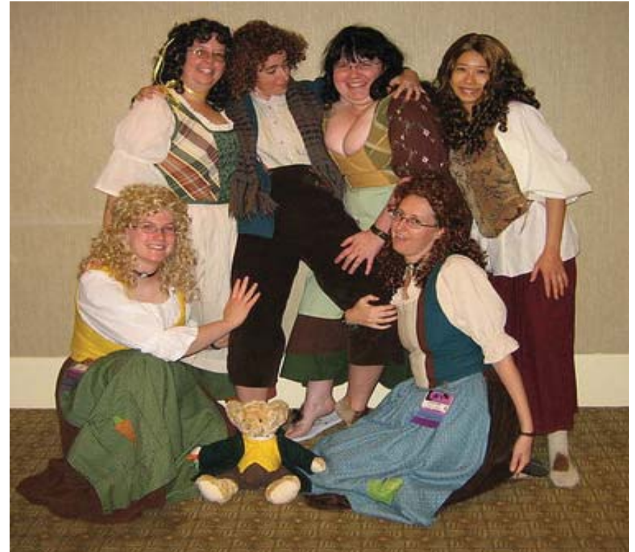
Hobbit Lasses celebrating Pippin's coming of age