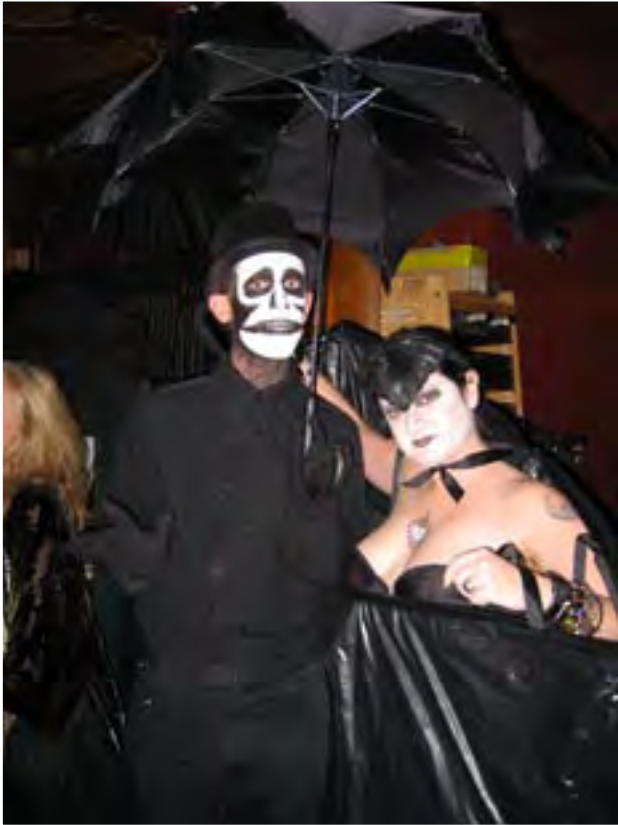
Edward Gorey Couple

Yes, as I mentioned before, this is where the worlds began colliding. I ran into people from my vintage dance community, which I expected, but I also ran into a group of folks I camped with in the Black Rock Desert. They were surprised to see me there, and so was I. But it all made sense to us as we realized we were all into non-mainstream art and culture, performance art, dance and costuming! One of them offered me a name tag with a name from one