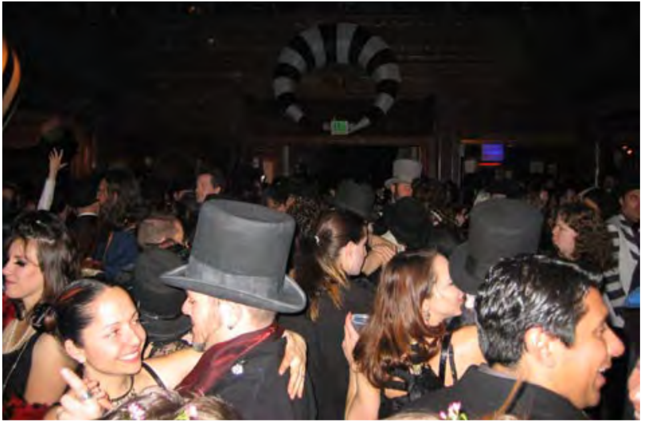
Dancers in the Ballroom