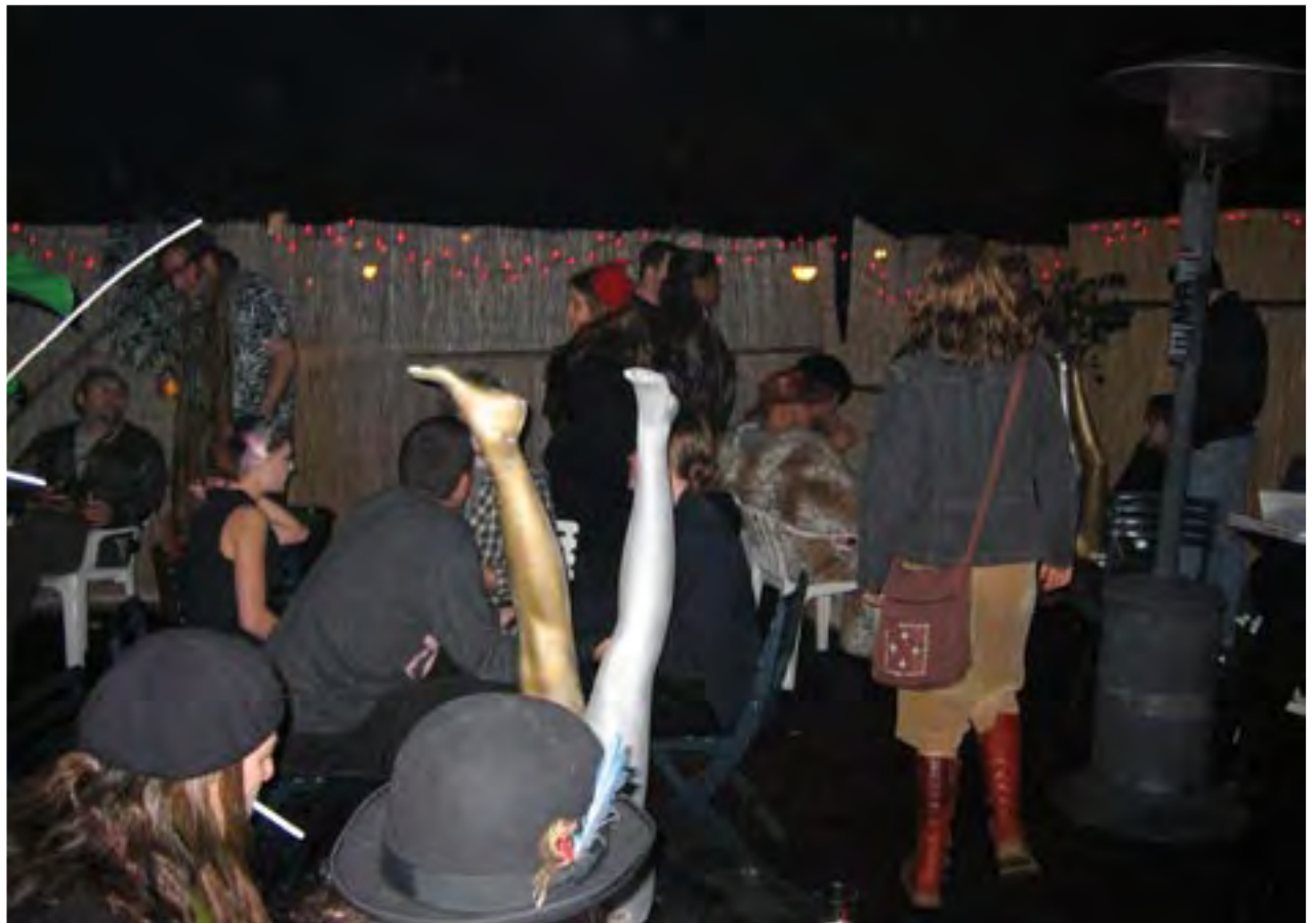
Open Air Lounge at the Anon Salon afterparty.

For more information, visit: http://www.edwardianball.com/ and http://www.anonsalon.com/