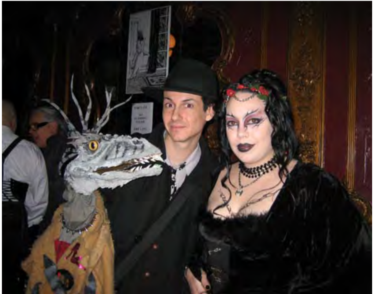
Edward Gorey Creature and Characters

Ball where I performed during the Music Hall intermission) and it reminded me that it would be a good event for me to go to (seeing as I'm into dance and costuming) and something that I would like to cover for SF/SF.