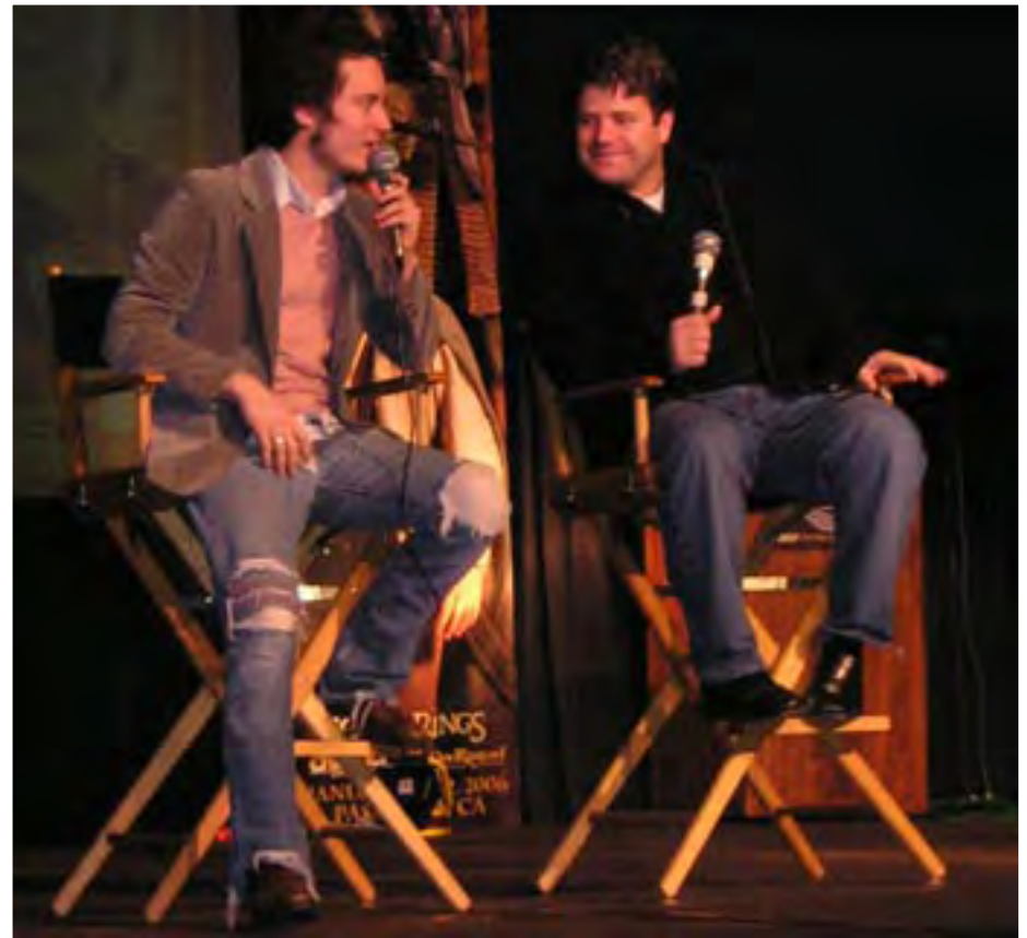
Elijah Wood and Sean Astin.