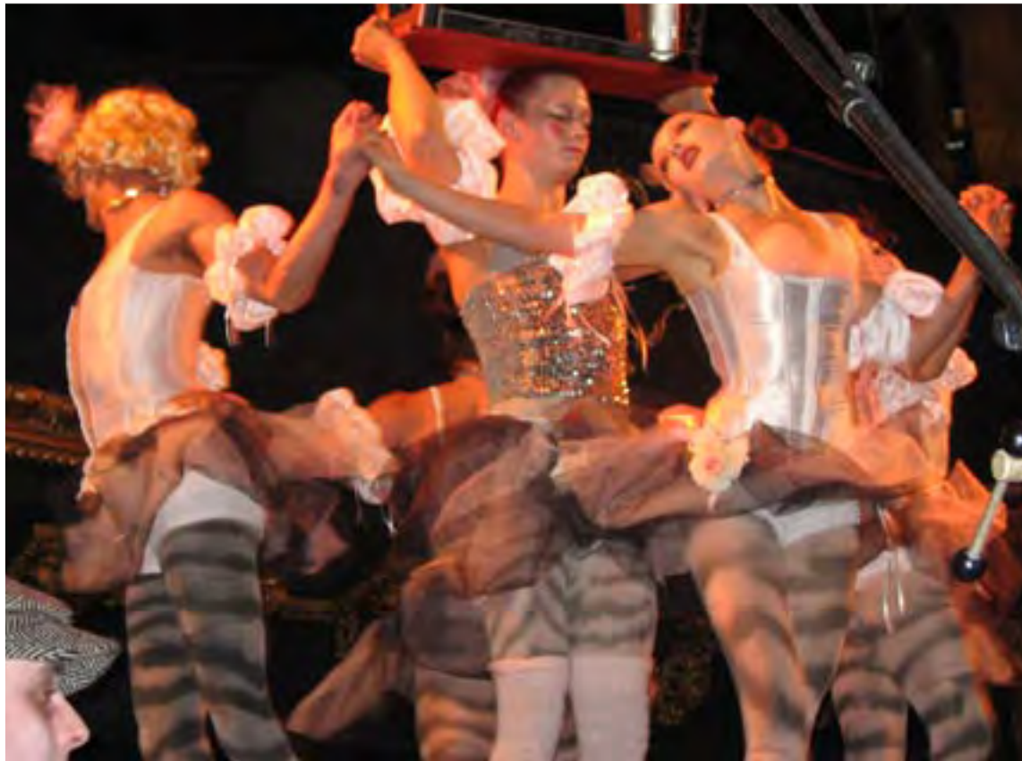
Vau du Vire Acrobats

There were several rooms on two floors. The first floor, which was actually on the second