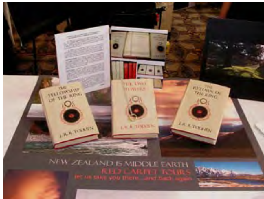
U.K. first editions of The Lord of the Rings, 1954-55.