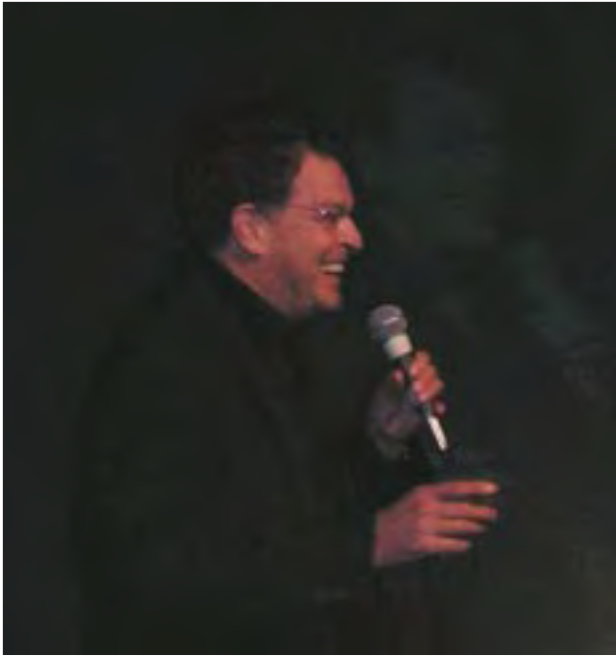
John Noble

thorough preparation, a slow infiltration into his role, taking on voice, gesture, and working with props, so that when he goes before the camera it's not really acting – he IS the character. During the wardrobe and makeup process each day he became Denethor. In John's view, "the craft is about getting inside a character and playing that truth," regardless of medium.