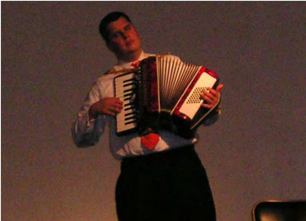
Daniel Handler shows his talents extent to more than writing.

Handler floated effortlessly from topic to topic, taking his enthusiastic audience