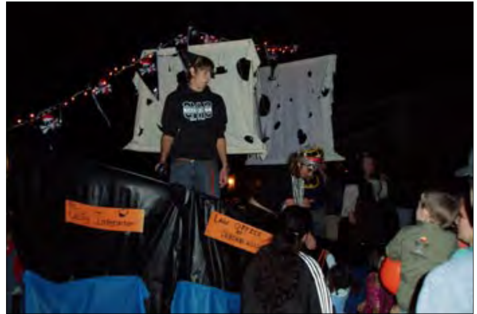
Foster City Pirate Ghost Ship

The Foster City event was wholesome entertainment. We followed my nephew as he trick-or-treated through several blocks of beautiful and amazingly decorated houses in one Foster City neighborhood. There were hundreds of people who were kept safe as the local police blocked off traffic