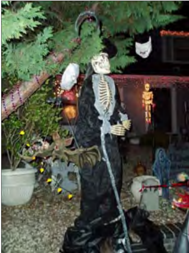
Foster City Skeletons Out and About

Halloween... Samhain... All Hallow's Eve. The one night of the year when the spirits of the dead and of the underworld are said to all come into our world and