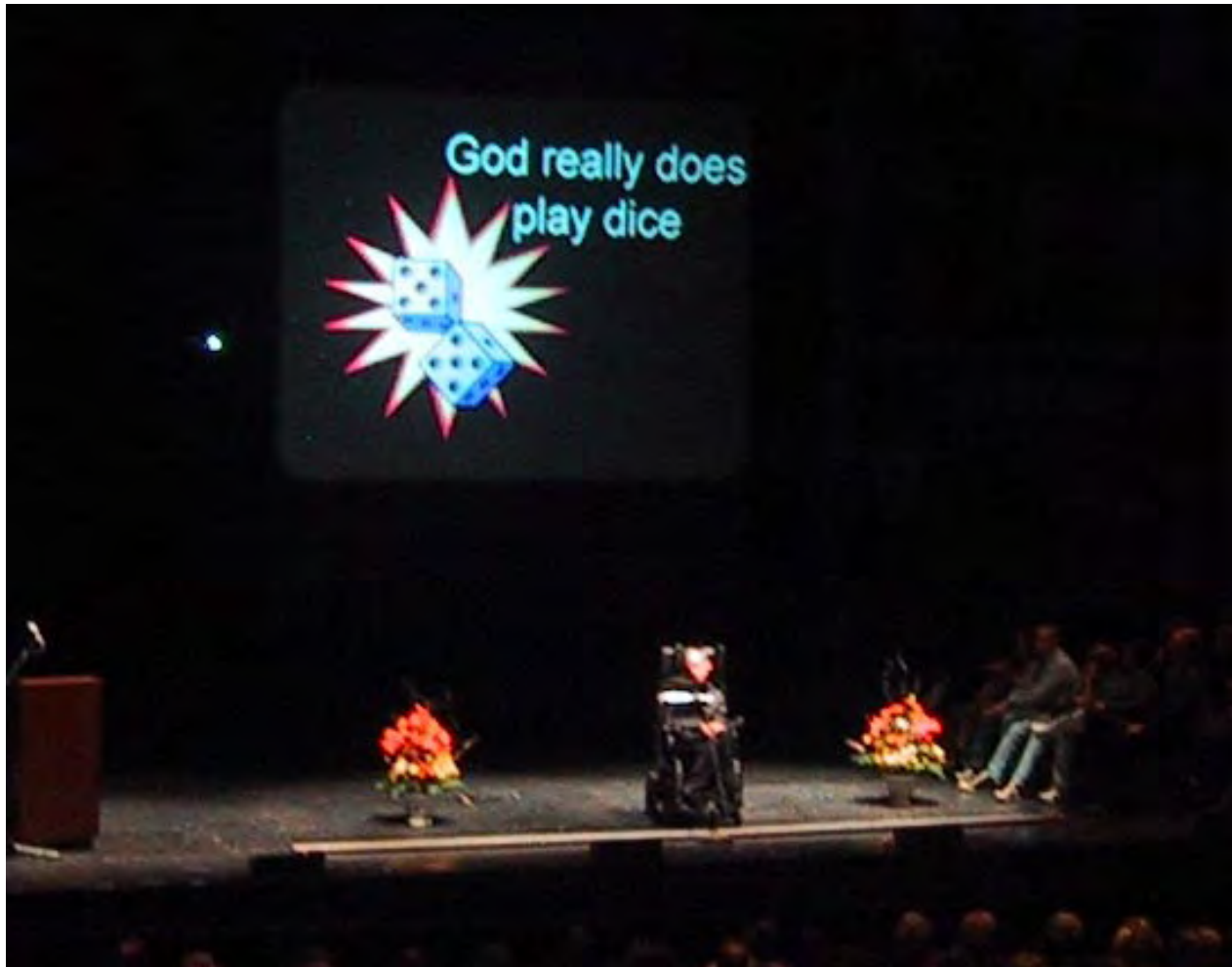
God Really Does Play Dice With the Universe

Well, here is my brief summary of his brief history. Basically, his talk, entitled "The Origin of the Universe," aimed to address two questions humans have asked since we evolved into thinking and conscious beings: "Why are we here?" and