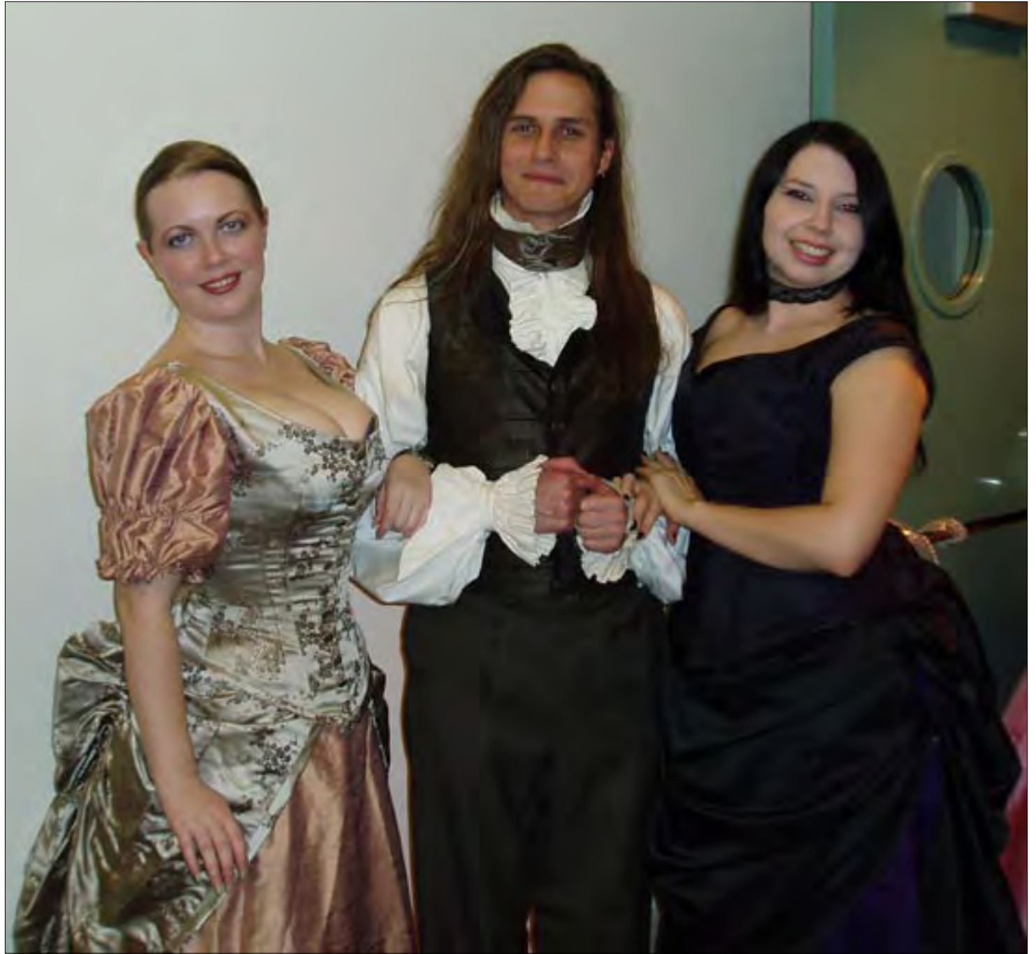
More Victorian Vampires

During the band break, Theater of the Vampires entertained the crowd with a three-part performance that looked at different periods of time when vampires thrived. The first was set in the 1970s where a young vampire wooed a model with his disco dancing ability. The second part was an interpretation of Sheridan Le Fanu's novella, Carmilla , which showed the dangers a female vampire imposes. The last part was a comedy titled Carpe Draculum , where a family of vampires attempts to adjust to the modern world. The play ended—as many of the guests' evenings ended—with the question, “who should we have for breakfast?”