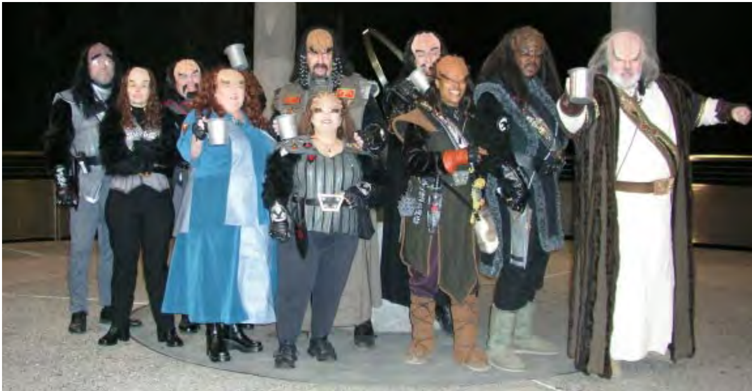
Klingons from the Starfire Region at the Mars Will Return Event at Chabot Space Science Center in October

And the rumor of the week was '80% of BASFA's members are away, waiting in line to vote at their polling places'.