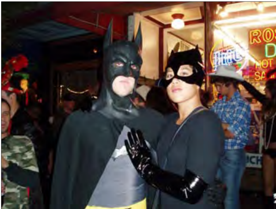
Batman and Batgirl in the Castro

As I walked toward Market and Castro, I saw a huge sea of people for blocks on end.