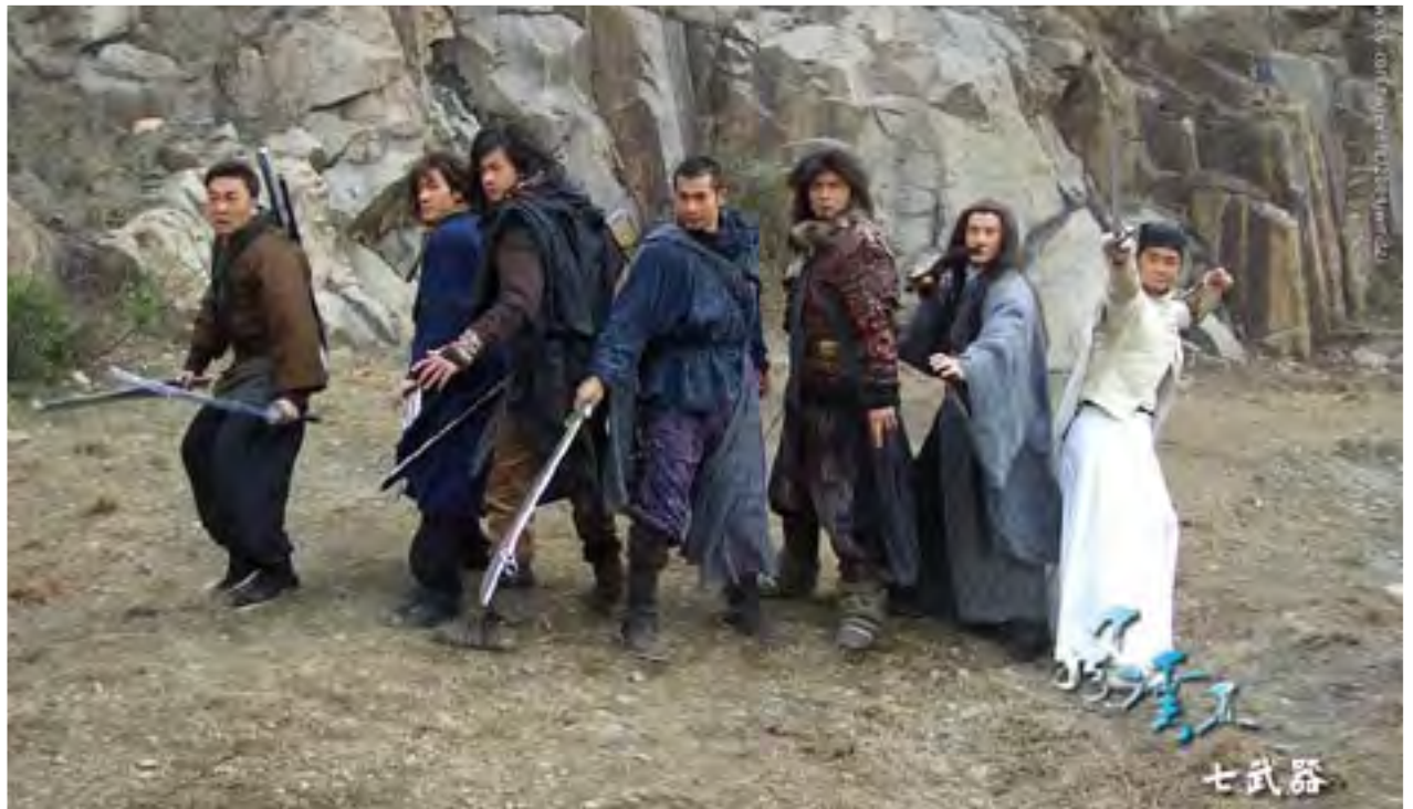
Our Heroes Assemble!

And then we have the plot. It's based on the Storm Riders comic book by Mah Shing Wing, so not much can be expected.