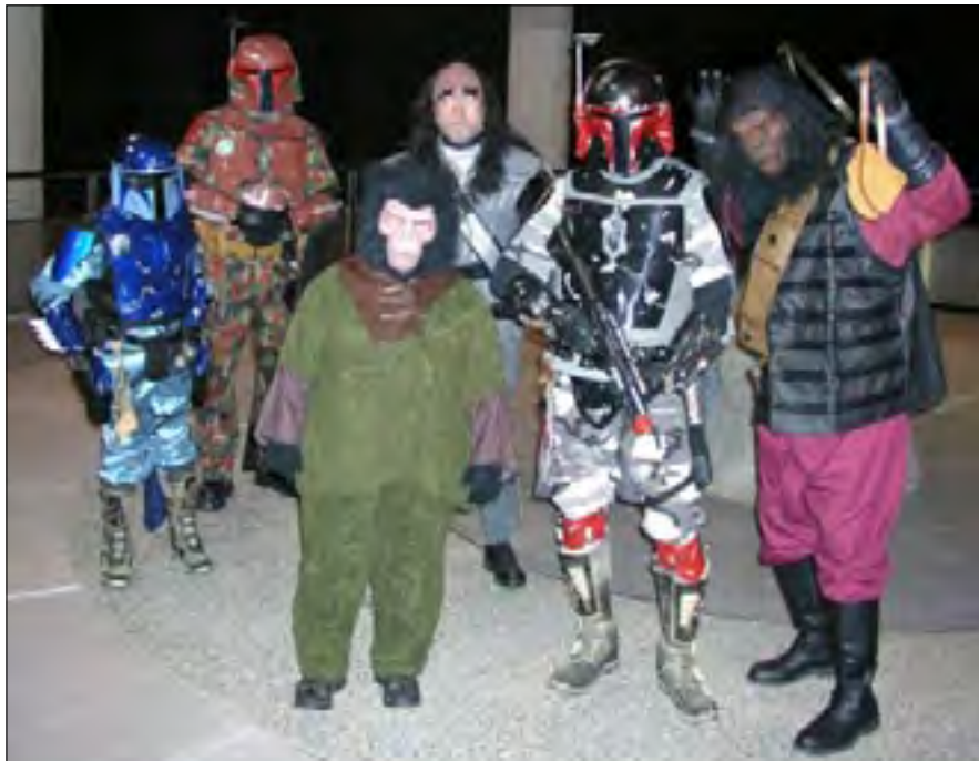
A mixed group of aliens at the Lunar Express Event at Chabot Space Science Center in October

BASCon is usually at the same time of year, which happens to be just before my birthday, so I’ve come to view it as a very nice birthday present – a chance to visit with old friends, let my hair down (metaphorically) and eat too many carbs. What can be better?