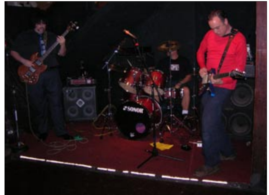
Savage Curtain plays the Scotty Tribute