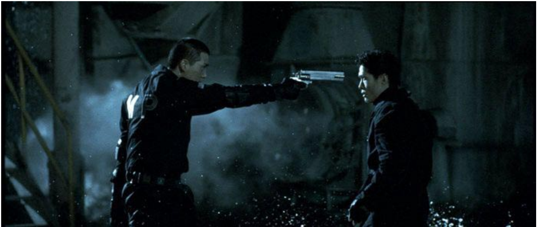
From Natural City

While not a perfect movie, Natural City is certainly an entertaining action movie with a plot that depends on close to real science fiction to drive it.