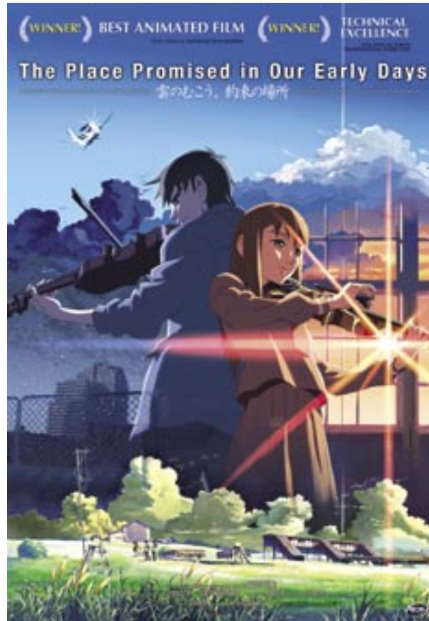
From The Place Promised in Our Early Days

While a HK movie, Killer's Romance is loosely based on the Japanese manga Crying Freeman . It has lots of gunfights and sword fights, but is not sf. Nonetheless, with Simon Yam and Joey Wang starring, this is worth a look. Vendetta is also a crime thriller