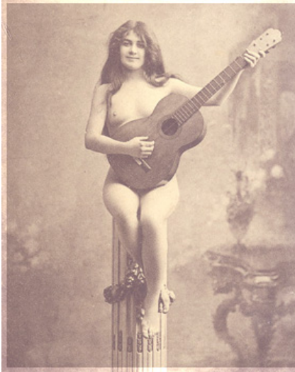
An early groupie. Music and sex have always gone together.

Nothing substantial ever really came out of that particular garage band, but it was a beginning. Besides being a great learning experience, it was so much fun, and whetted my appetite for more.