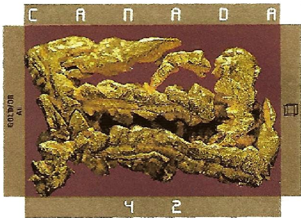
A stamp depicting a gold nugget, issued by Canada Post when postage was 42 cents and gold was in the $200s.

ounce used by Americans, or just over 31 grammes. Good Delivery bars weigh 400 ounces, about 13 kg, and are the size of a brick. They have sloped sides to make it easier to pick them up because gold is not only heavy but slippery.