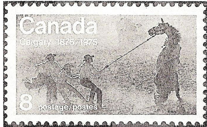
Stamp issued 1975 for Calgary's centennial.

Thus endeth another exciting day in Cowtown, where seldom is heard a discouraging word except when the price of oil drops below $50.