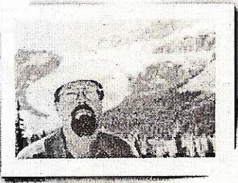
Illustration: Patricia Ford For sale on the internet Part page on stamp website