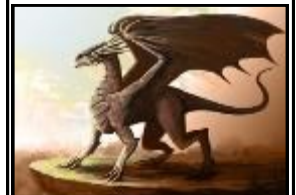
Cover Art: “Dragon” By Janice Duke