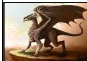
Cover Art: “Dragon” By Janice Duke