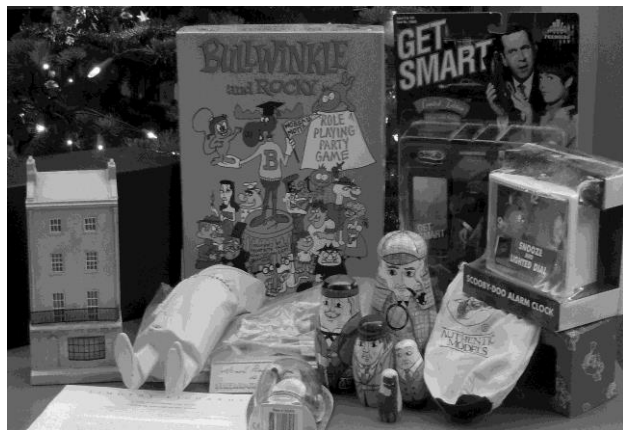
Items #26 - #32 of the Shiffman Collection