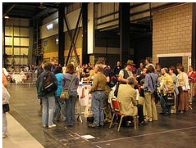
The Pratchett Line