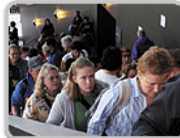
Cinequest, where they showed last year's 48 Hour Films