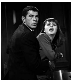
Outer Limits (1964)