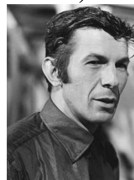
Mission Impossible (1969)