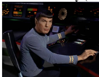
Star Trek TV series (1966)