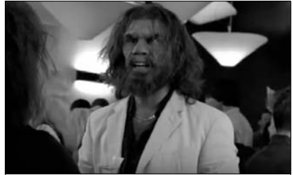
I'll have the roast duck with mango salsa.