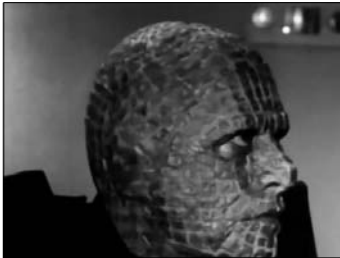
Reptoid Jeffrey Tambor, or a glazed ham?

[Scary! And his idea of what I'll call "Peak Science" is depressing. What are your disagreements with his lecture?]