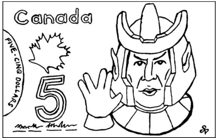
Leonard Nimoy (1931–2015)