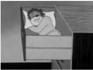
Not to be confused with Geeks after dark.