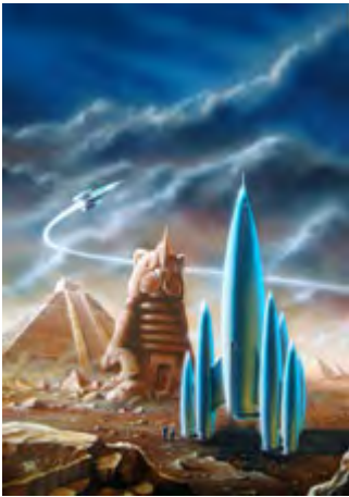
Sample poster art.