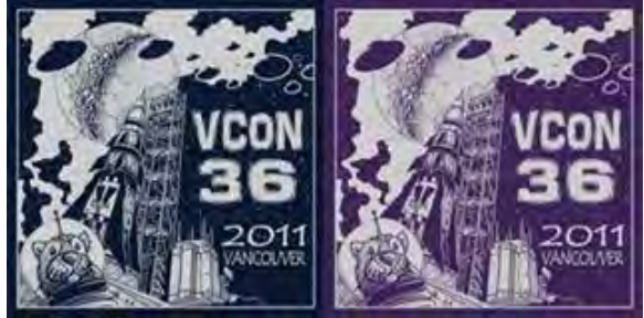
Sample T-shirt art.

• Available in two colour variations—navy blue or royal purple—and in nine sizes—Youth L (Adult XS) to 5XL.