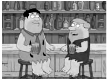
The Flintstones on Family Guy.

MacFarlane says that the characters will look the same as before, but the stone-age-technology comedy will be updated: “What is the animal version of an iPad?” (An iPaw?)